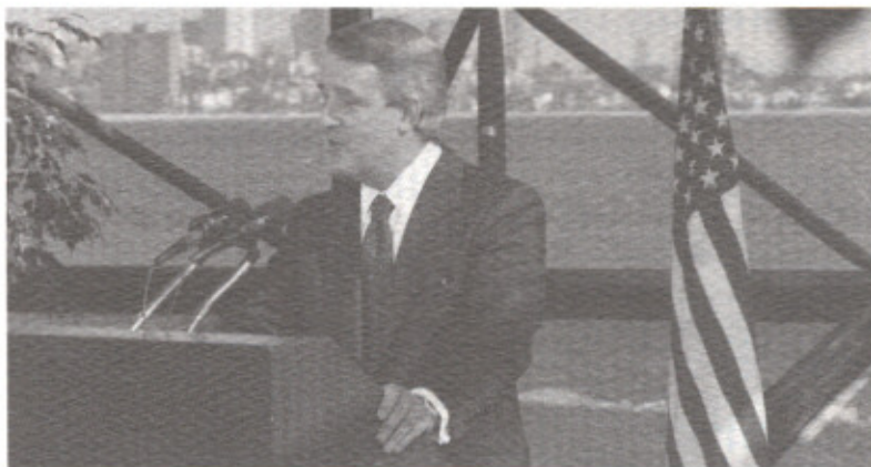
Prime Minister Brian Mulroney of Canada.

One hundred fifty people attended the Kennedy Library breakfast at which Senator Kennedy presented Prime Minister Mulroney with a bust of President Kennedy. Senator Kennedy spoke of the great ties between United States and Canada and noted that during his brother's