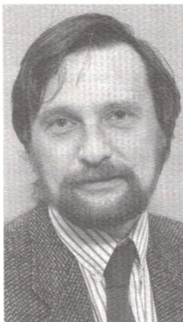
Biographer Nigel Hamilton.

Powers is one of Hamilton's best resources, but he is eager to probe more obscure subjects,