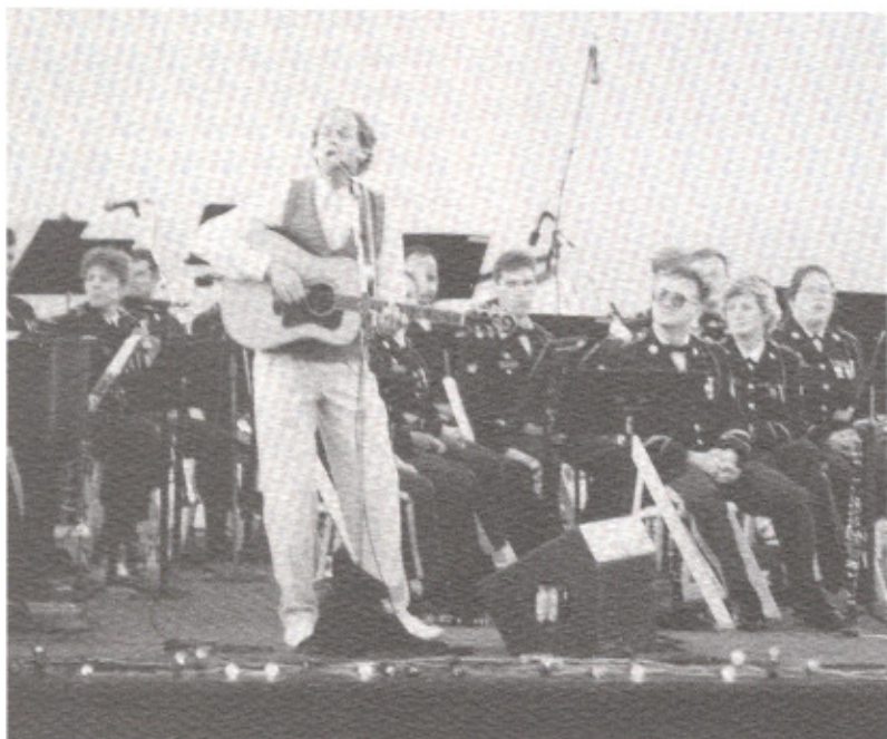
Folksinger Livingston Taylor and the 18th United States Army Band.

Now in its third year, the Father's Day concert has become an eagerly anticipated summer event in Boston. It is not only a special way to treat dad to an evening out, but also a neighbor-