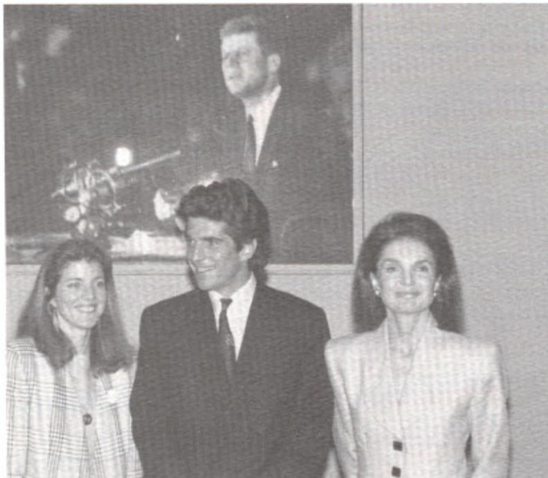
(from left to right) Caroline Kennedy, John F. Kennedy, Jr. and Jacqueline Kennedy Onassis at May 25 press conference announcing the Profile in Courage Award.

According to Senator Kennedy, the award will be presented annually to the public official or officials, at the federal, state, or local level, who best exemplify the quality of political courage.