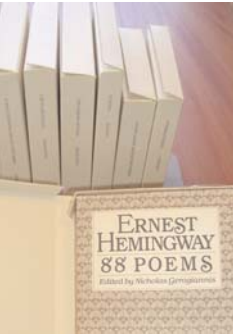
Hemingway’s personal book collection in custom made boxes.

Kennedy Library staff have also concentrated preservation efforts on the impressive collection of books from Hemingway’s private library. The collection includes an unnumbered and unbound press copy of James Joyce’s Ulysses with Hemingway’s signature on the cover page as well as a draft of Ezra Pound’s Cantos published by Three Mountain Press printed specifically for Hemingway on handmade watermarked paper. Hemingway’s handwriting is scrawled along the margins throughout his