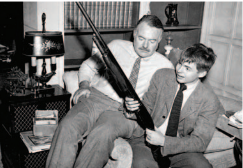
Ernest and Patrick Hemingway, 1946

Masthead photograph by Earl Theisen, courtesy of Earl Theisen Archives