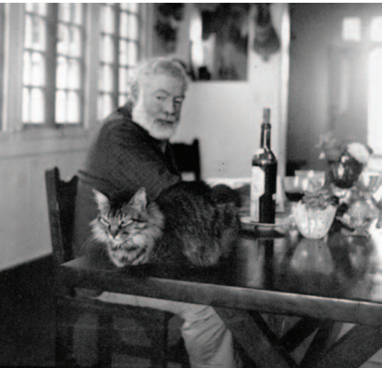
Not dated, 1950's, Ernest Hemingway with his cat Cristobal Colon, at the Finca Vigia, the Hemingway home in Cuba