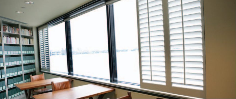
The Hemingway Room at the John F. Kennedy Presidential Library and Museum

Other preservation efforts include the rehousing of diaries and fishing logs that Hemingway maintained and where he recorded the type, quantity and size of fish he saw as well as the count and size of those caught. As part of our preservation effort they have been measured for individual boxes and will be placed in an individually labeled Microclimate clam shell box to limit deterioration from handling, acidity, light and rapid changes in temperature and humidity.