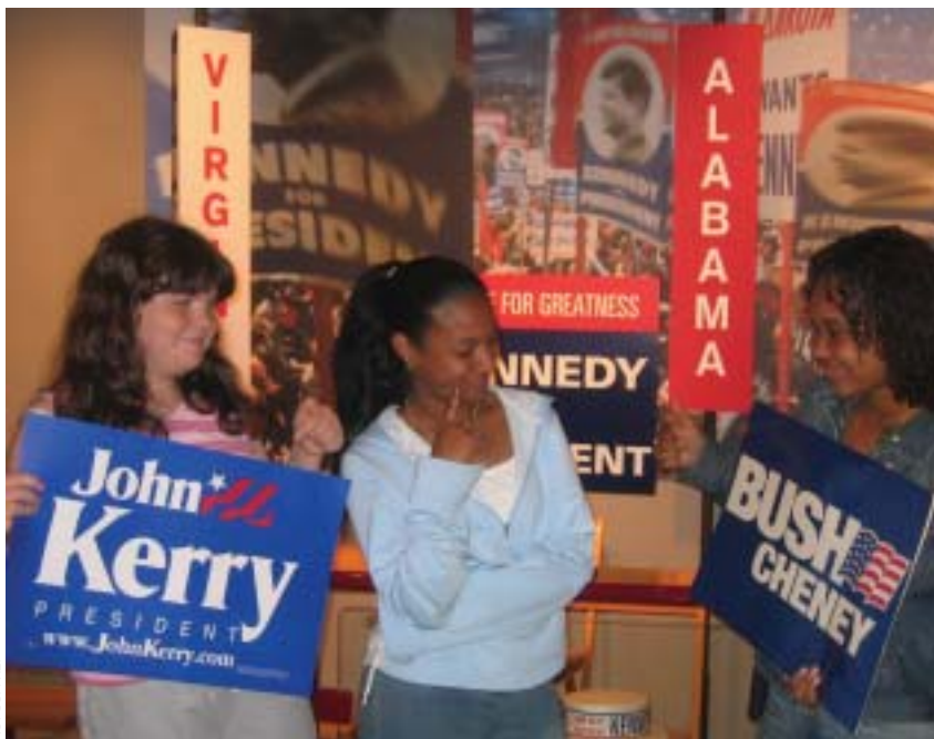
Students discover the importance of political participation.

The National Student/Parent Mock Election makes students and parents aware of the power of their ballot by actively involving them in a full-fledged campaign and national election. The voting results for 70,756 elementary, middle and secondary students throughout Massachusetts were reported to the Kennedy Library by the 290 participating groups between October 28 and November 1, 2004. In addition to voting for presidential candidates, students also voted for Congressional candidates and issues that were most significant to them.