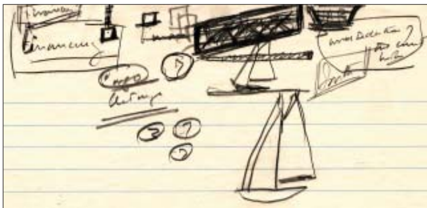
President Kennedy's doodles of his sailboat, Victura .

The subject matter of the newly released material varies enormously. Many are handwritten notes that read more like statements or drafts. Other doodles outline key words or phrases from a meeting. For example, during a November 15, 1961 National Security Council meeting on Vietnam, the President noted and underlined the