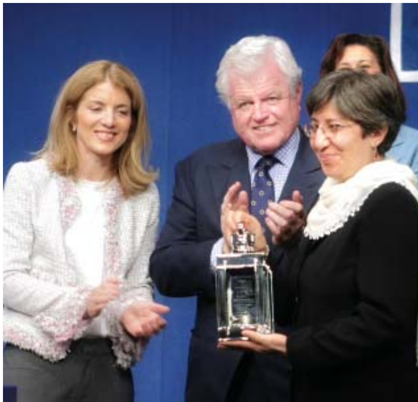
Dr. Sima Simar accepts the Profile in Courage Award's Silver Lantern from Caroline Kennedy and Senator Edward M. Kennedy.