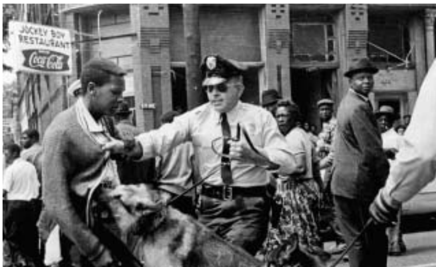
Birmingham, Alabama police use police dogs to attack civil rights demonstrators during May 3, 1963 protest.

The President comments on the shock of the photograph at several points during the meeting and states with aggravation, "I mean what law can you pass to do anything about police power in the community of Birmingham? There is nothing we can do... The fact of the matter is that Birmingham is in worse shape than any other city in the United States, and it's been that way for a year and a half... I think it's terrible the picture in the paper. The fact of the matter that's just what (Police Commissioner of Birmingham) (Bull) Connor wants. And, as I say, Birmingham is the worst city in the south. They have done nothing for the Negroes in that community, so it is an intolerable situation, that there is no argument about."