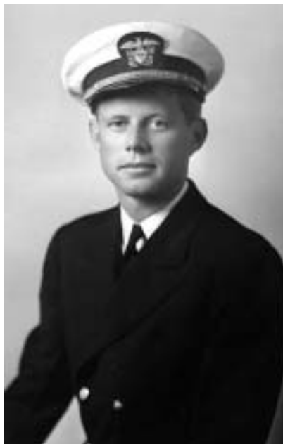
First Lieutenant John F. Kennedy.

Among the items featured in the exhibit will be Kennedy's own scrapbook of snapshots showing him and his young comrades in arms, the actual logbook of the PT 109, Kennedy's Navy uniform, the coconut shell on which he scratched a message that brought rescue for his crew after PT 109 was rammed by a Japanese destroyer, framed photographs from the war