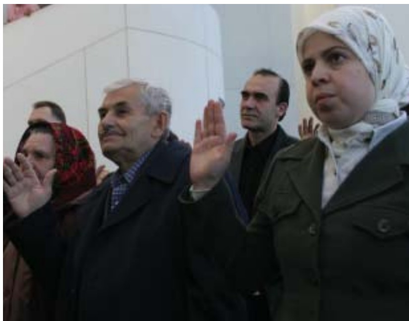
New Americans take the oath of U.S. citizenship in Library Pavilion.