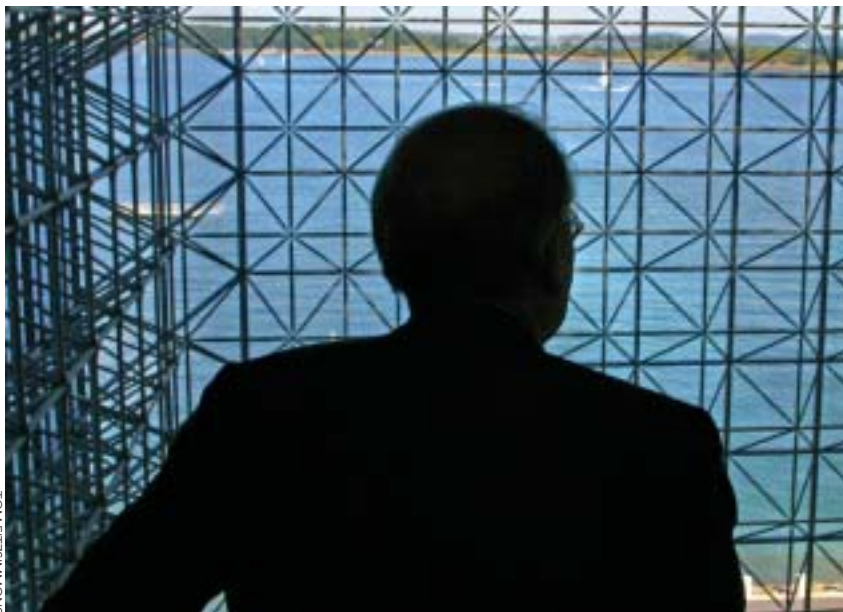
I.M. Pei views Boston Harbor framed by his geometric design of the glass Pavilion.

"When we were offered Columbia Point at that time, next to UMass, we looked at it, and at that time you have no idea what this place was; it was a dump," Pei said. "When we excavated, we found old sinks and old refrigerators and things of that kind. There was actually methane gas coming out of the soil. You could light a match on