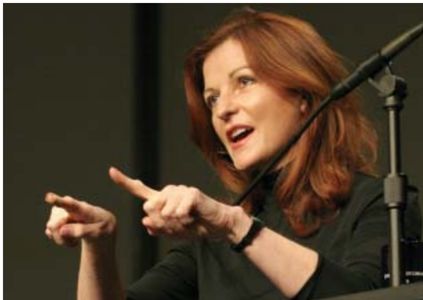
New York Times columnist Maureen Dowd.