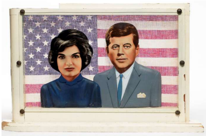
President and Mrs. Kennedy Shadowbox.

Carved peach pit depicting an image of John F. Kennedy wearing a veteran's hat. To the left is carved an eagle sitting on a shield and below that is St. Christopher.