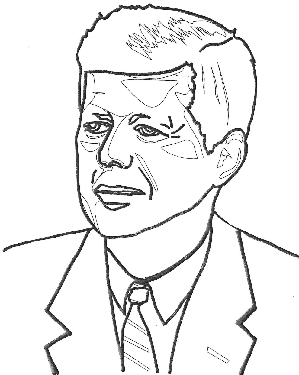
President John F. Kennedy

Department of Education and Public Programs