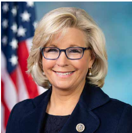
Liz Cheney U.S. Congresswoman, At-Large, Wyoming (R)

In February 2022, as Russia mounted a massive, unprovoked military assault on Ukraine, President Volodymyr Zelenskyy marshaled the spirit, patriotism, and untiring sacrifice of the Ukrainian people in a life-or-death fight for their country—a struggle that endures to this day. From the first moment of the invasion, Zelenskyy and his family became targets for assassination by Russian forces. In the face of this constant danger, Zelenskyy has led a courageous defense of democratic ideals and political independence. With candor and clarity, he has focused the eyes of the world on the existential threat facing Ukraine, and on the need for robust, uncompromising international engagement and cooperation to safeguard all democratic societies. His principled leadership has strengthened the resolve of Ukrainians and people around the globe to protect and defend the fragile human right of self-determination.