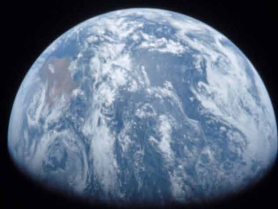
Earth rising over the Moon’s horizon as seen from Apollo 11 during its successful mission to the Moon in July of 1969

This fall, through a worldwide digital engagement campaign and a special series of partnerships and events in Boston, the JFK Library and Foundation will bring President Kennedy’s challenge to life for a new generation committed to solving the problems of our own time.