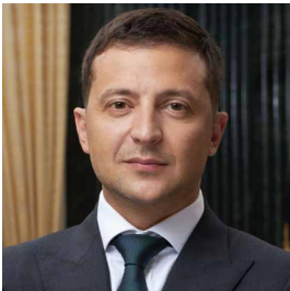
Volodymyr Zelenskyy President of Ukraine

For the first time ever, the Profile in Courage Award is being presented to five individuals at the local, state, national, and international levels, each for their courage to protect and defend democracy in the United States and abroad. The John F. Kennedy Library Foundation salutes this year’s award recipients—and the public servants at every level of government upon whose courage and principles any free and democratic society depends.