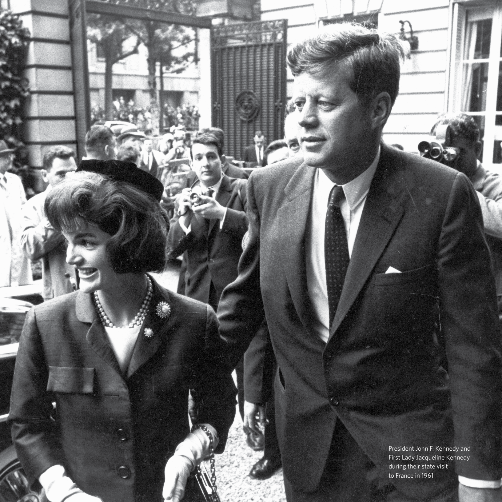
President John F. Kennedy and First Lady Jacqueline Kennedy during their state visit to France in 1961