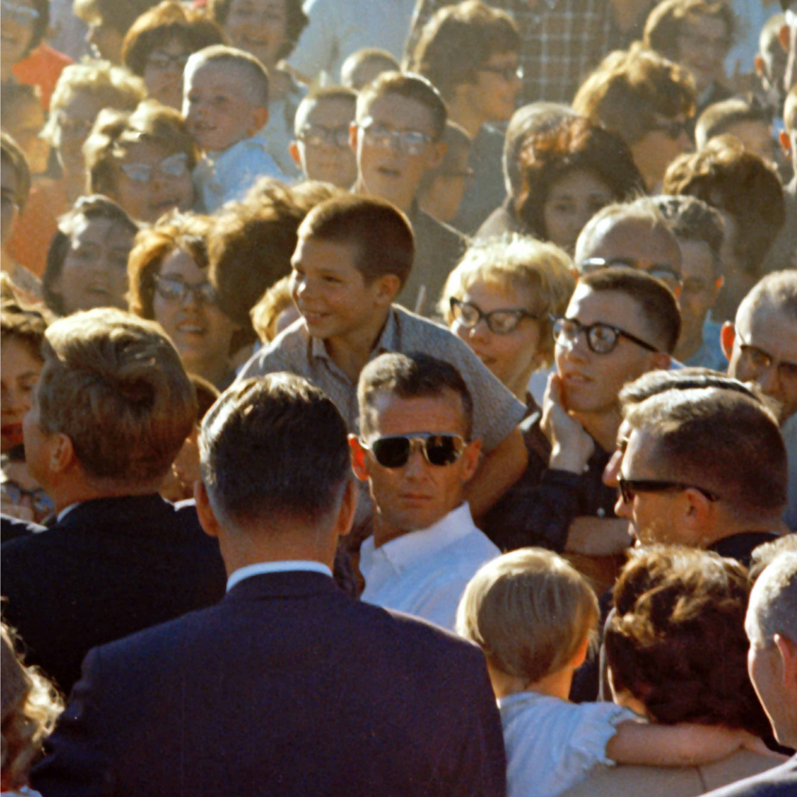
President John F. Kennedy during his visit to the Yellowstone County Fairgrounds in Billings, Montana on September 25, 1963