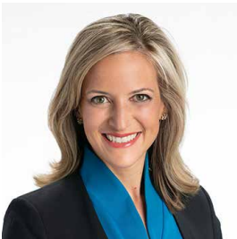
Jocelyn Benson Secretary of State, Michigan (D)

In December 2020, shortly after the presidential election, Michigan Secretary of State Jocelyn Benson was at home putting up Christmas decorations with her young son when armed protestors massed in front of her house demanding that Michigan’s presidential election result be reversed. Protesters called Benson a “traitor” and a “criminal” for defending the certification of Michigan’s accurate results, which favored Joe Biden. Benson, the state’s chief elections officer, did not waver, and defended the will of Michigan voters and assured them that she would protect and defend the integrity of Michigan’s vote in accordance with state law. Throughout the 2020 election cycle, Benson repeatedly refused to back down from fulfilling the duties of her office, even as threats and harassment from then-President Trump and his allies grew increasingly aggressive. Benson continues to speak out about the risks to free and fair elections in Michigan and nationwide, as Trump supporters continue to perpetuate false claims and work to seize control of state and local election processes from duly elected or appointed public servants.