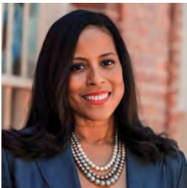
The Honorable Mia McLeod South Carolina 22nd (I)

In the immediate aftermath of their filibuster, the Sister Senators were heckled and harassed by anti-abortion activists. The three Republicans were also met with strong opposition from their own party—including censures and promises of primary challenges in 2024. Weeks later, when the governor called the South Carolina legislature into a special session to further curtail abortion rights, the Sister Senators remained in alliance and stood strong in opposition to a measure banning most abortions at the 6th week of pregnancy. Despite their efforts, that legislation was eventually passed into law.