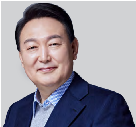
His Excellency Yoon Suk Yeol President of the Republic of Korea

A special international Profile in Courage Award is being presented to the leaders of South Korea and Japan for working to improve relations between their countries, despite domestic opposition stemming from historical issues.