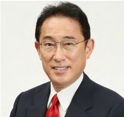
His Excellency Fumio Kishida Prime Minister of Japan

U.S. Secretary of State Antony J. Blinken